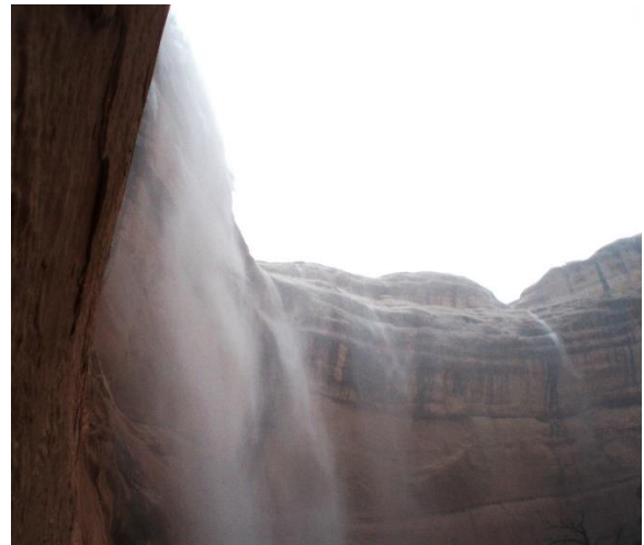
Grand Gulch 10/4/2010 - Scott

Big splash, you say? Can you beat this rainy day in Grand Gulch? - Ed