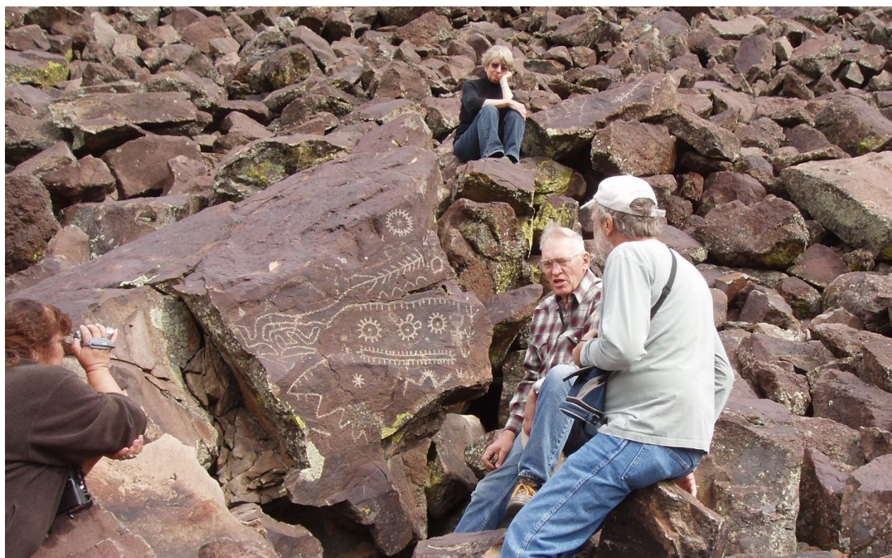
From the archives