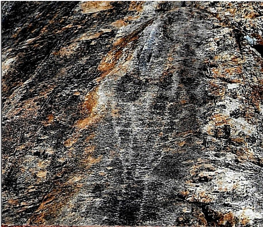
Stansbury Island, Tooele County, Utah, November 2020, Oscar Olson